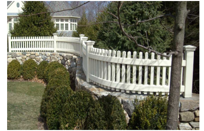
Custom Fencing & Stone