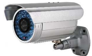
Mini CCTV Camera

For more information on the installation and a no-obligation security survey, please contact our office. 1-800-486-7553