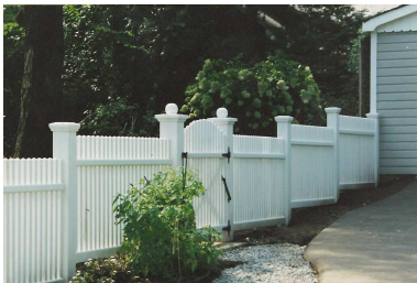
Garden and Yard Fencing