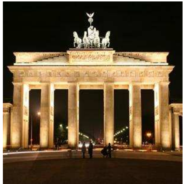
Brandenburg Gate, Berlin

Today the Brandenburg Gate is a symbol of German unity and can be found on the bottom side of the euro coin.